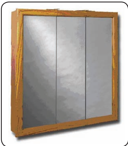
description: MEDICINE CABINET TRI-VIEW OAK EDGE size: 24" x 30" with light 30" x 30" with light 36" x 30" with light