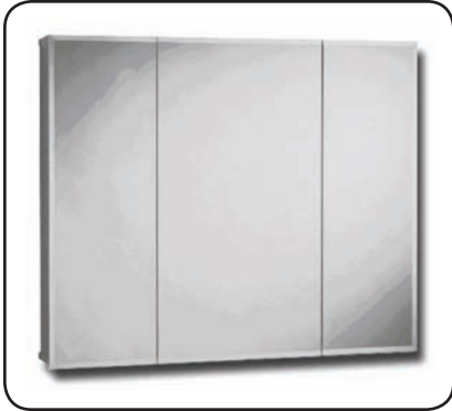
description: MEDICINE CABINET TRI-VIEW BEVELED EDGE size: 24" x 30" with light 30" x 30" 36" x 30"